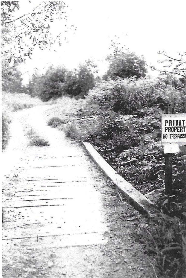
The Bridge At the Entrance to 945 Country Club Rd. 1962