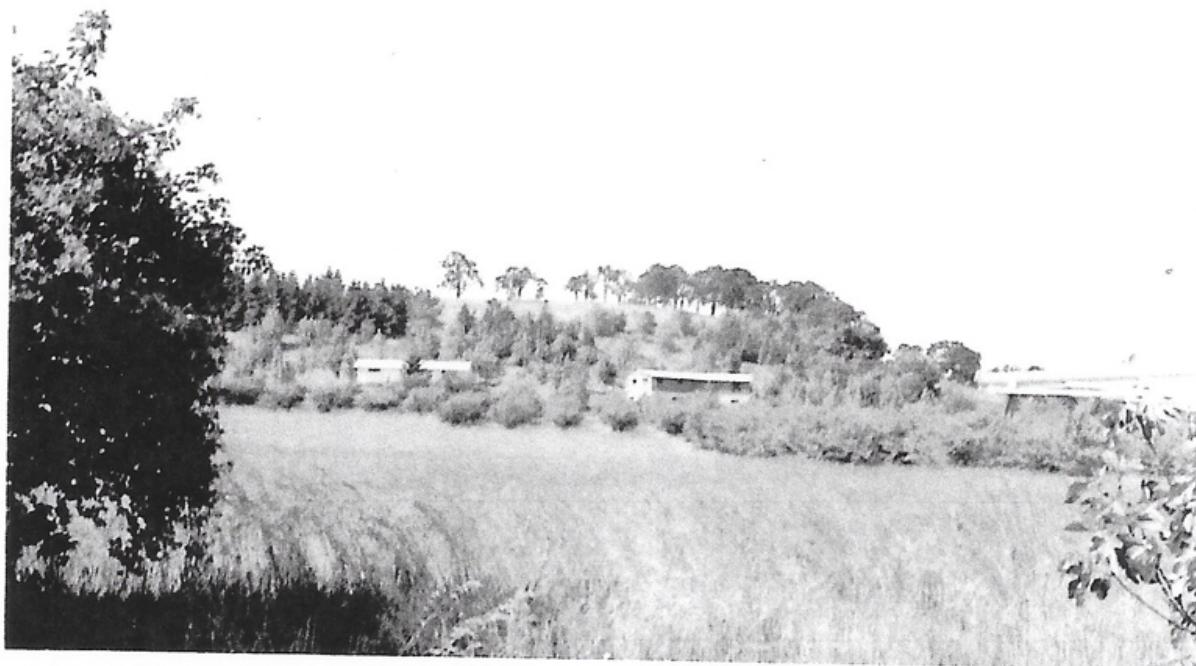
Looking North Toward Gillespie Butte 1961