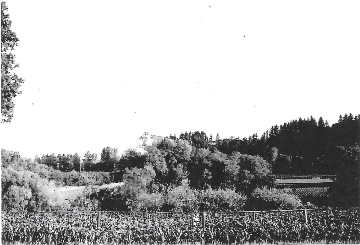
Looking South Toward Skinner's Butte 1954