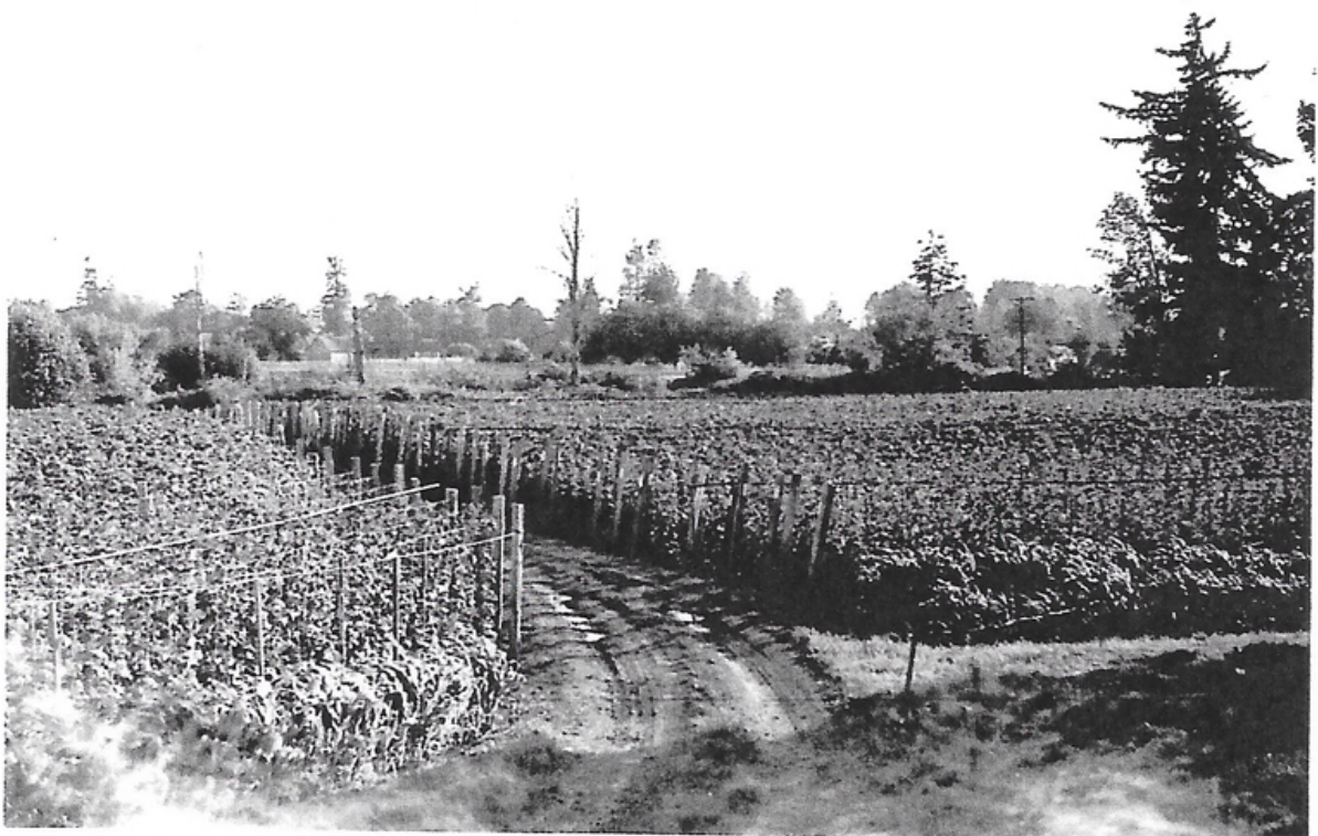
Looking Southwest Across the Bean Fields 1954